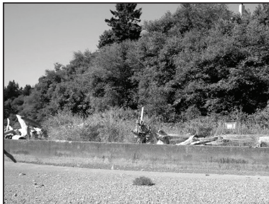
Campsite is above bulkhead