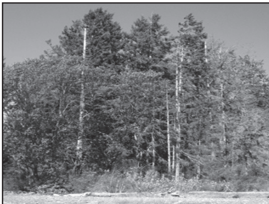
The campsite is tucked into the forest.