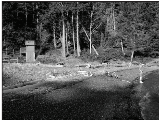
From site looking SE