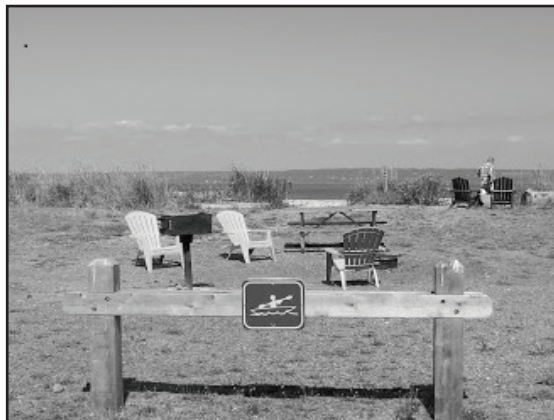
View from camp site on beach

NOAA chart 18446 SeaTrails chart WA 202 & 104