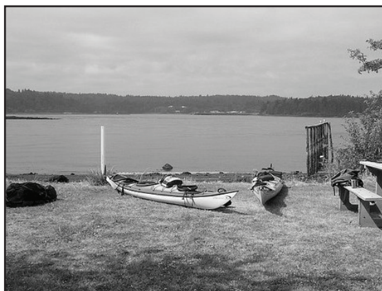
A low bank landing, site is right there