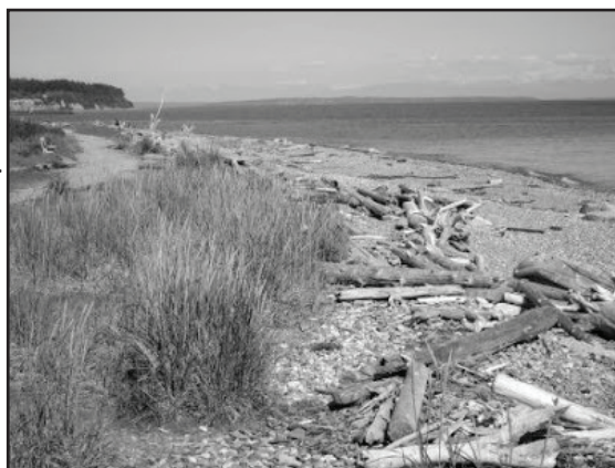
Many yards E of navigational beacon