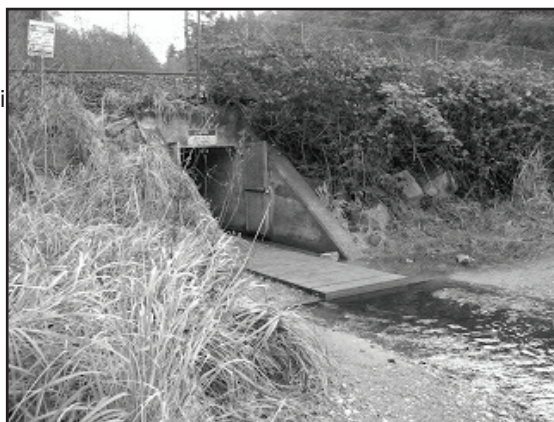
Site is south of the stream/tunnel under train tracks