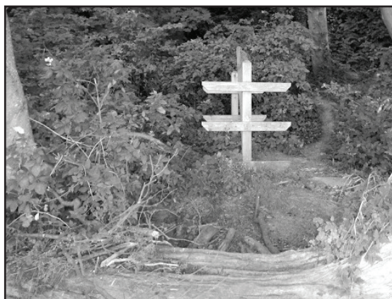
Landing is west of tree line. Site is past kayak rack up stairs to the west