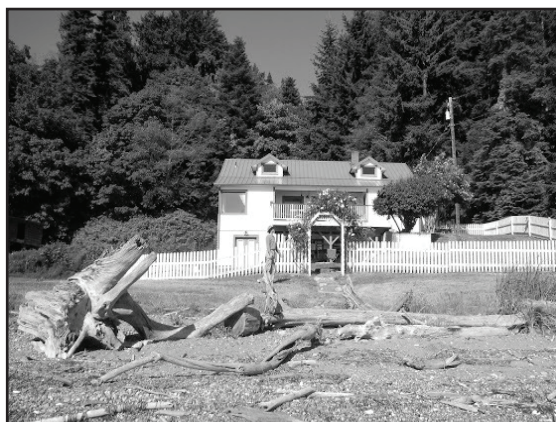
Land in front of caretaker house to avoid decaying bulkhead