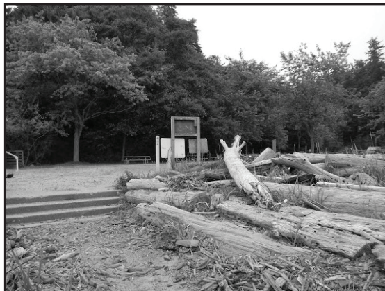
Landing is south of rip rap