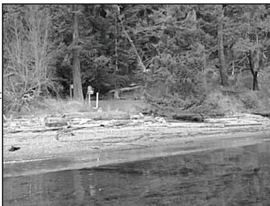
Note signs NW corner of harbor